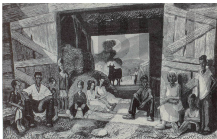
Sergei Sudeikin, American Panorama , Private Collection (Figure 2) 2

The depicted landscape is probably Nyack Beach State Park or Hook Mountain Park near Nyack, New York where the artist lived and spent the last decades of his life. These parks, on the banks of the River Hudson, were very popular with both local residents and visitors who came upriver from New York City, to enjoy the clean air, beaches and facilities. Much of this was constructed by the Civilian Conservation Corps during the Great Depression.